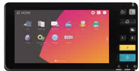
Customised to display up to 18 icons per page and with a different background.

Card Readers for these models are optional and can even be installed discreetly behind the cover of the systems. They not only give you fast and convenient access to your print jobs but also increases data security.