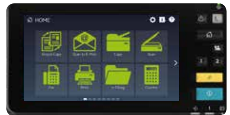
Display icons as buttons to easily access functions or start workflows.

A large tablet-like touch screen is your gate to document handling which has never been easier. It lets you work intuitively, helping you access instructions, functions and commands with the swipe of the finger.